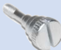
Captive thumb screw