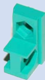
Card mounting bracket - plastic