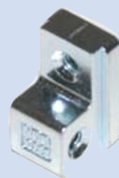
Card mounting bracket - metal