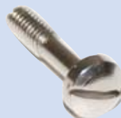
Captive slotted screw