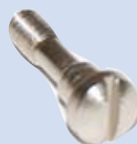
Captive slotted screw