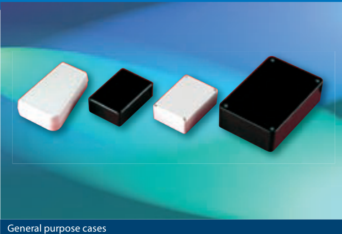
General purpose cases