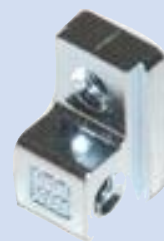
Card mounting bracket - metal