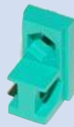
Card mounting bracket - plastic