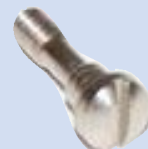
Fig .1 - Captive slotted screw