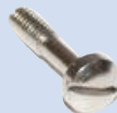
Fig .5 - Captive slotted screw