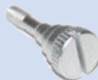
Fig .3 - Captive thumb screw